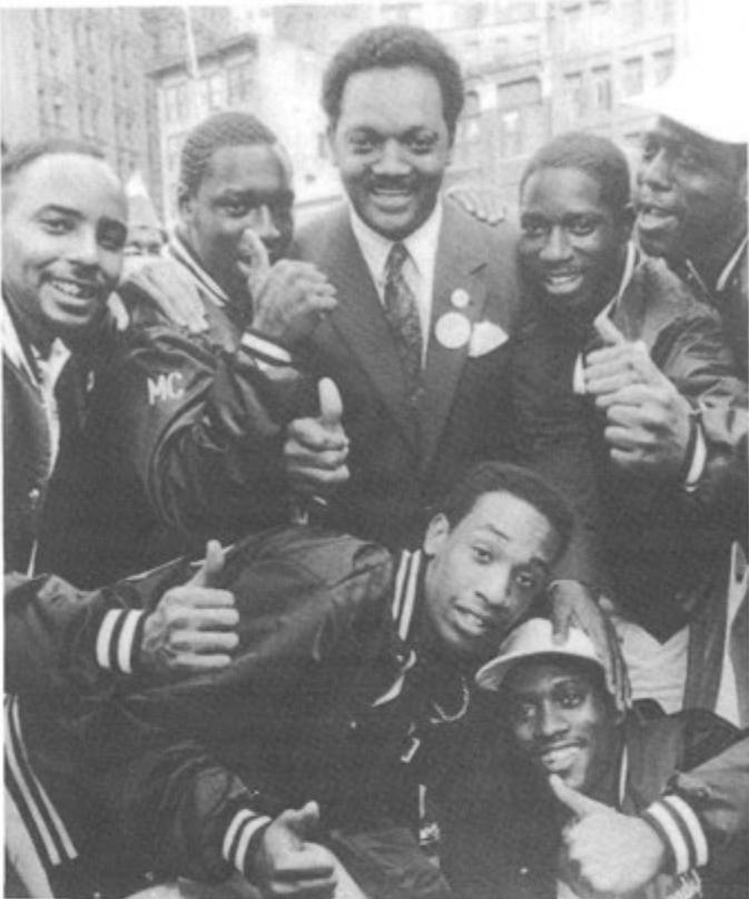
Rev. Jesse Jackson with Stetsasonic.