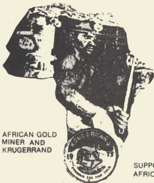
AFRICAN GOLD MINER AND KRUGERRAND

Carson Pirie Scott SUPPORTS RACISM IN SOUTH AFRICA!