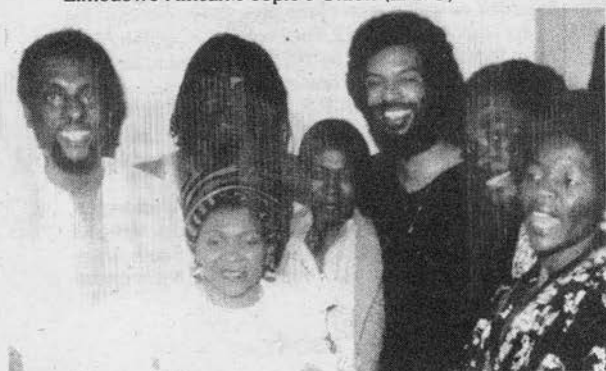
* Pictured Above

South African Students Organization South West Africa People's Organization 19th Bahman Iranian Student Association in the U.S., Supporters of IPFG United Black Movement Against Racism, Brazil Virgin Island Unity Conference Wilmington 10 Defense Committee, U.S.A. Zimbabwe African National Union (ZANU) Zimbabwe African People's Union (ZANU)