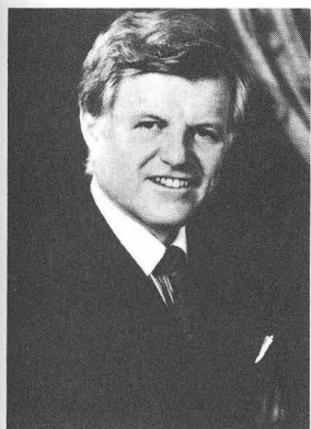
Edward M. Kennedy

Join Us at TransAfrica Forum's Seventh Annual Conference