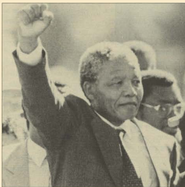
Nelson Mandela, leader of the ANC's negotiating team, gives a raised fist salute to supporters.

In his first public statement held in Cape Town Mandela said that the struggle has "reached a decisive moment: We call on our people to seize this moment, so that the process towards democracy is rapid and uninterrupted." He added, "Now is the time to intensify the struggle on all fronts. To relax our efforts now would be a mistake which generations