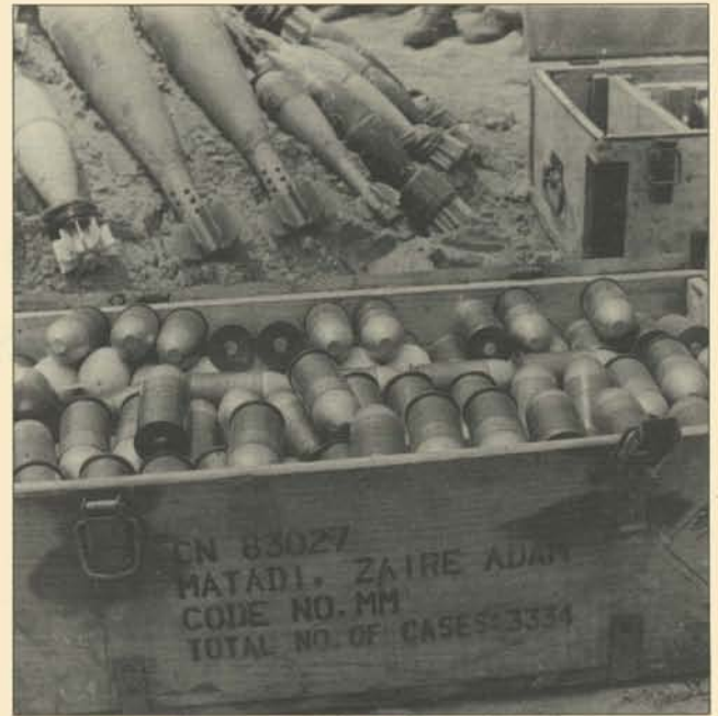
Captured U.S. arms supplied to UNITA.

In late November a CIA C-130 plane carrying arms to UNITA from Zaire crashed in Angola, killing four Americans. U.S. airlifted supplies reportedly continued throughout the conventional fighting in December and January. Nevertheless, without the overland sup-