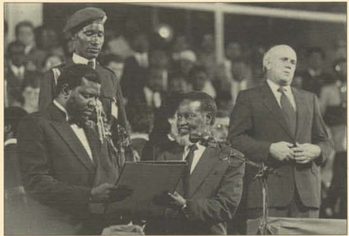
President Sam Nujoma swears in Hage Geingob as Namibia's first Prime Minister while F.W. de Klerk observes.

The new Namibian government is headed by President Sam Nujoma. Hage Geingob, former head of the Namibia Institute in Lusaka, is Prime Minister.