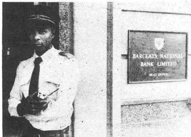
A security guard at the entrance to the head office of Barclays National Bank in Johannesburg.