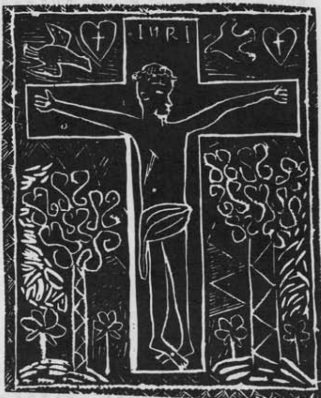
"Crucifixion" by Namibian Artist John Muafangejo