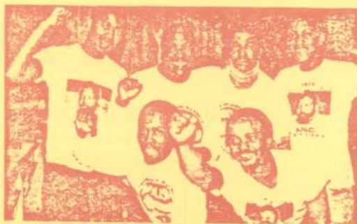
SECHABA — Musical group of the African National Congress (ANC), composed of South African exiles.

Around the world people are honoring Nelson Mandela by commemorating his birthday. In Albany, the Black Arts Festival will present Sechaba, the cultural/musical group of the African National Congress. Singing songs of struggle and liberation throughout the U.S. and Canada, their appearance at the Festival on Sunday, July 24, 1988 is a wonderful birthday tribute to Nelson Mandela. The Festival will take place at the Empire State Plaza beginning at noon. Check programs for the time of Sechaba's appearance.