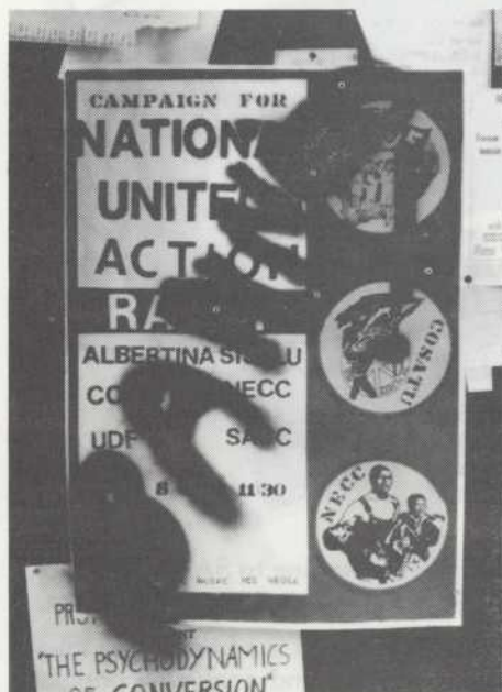
October meeting of the United Democratic Front at the University of the Witwatersrand banned by the police.

Disaffection among young, white conscripts from service in the South African Defense Force also seems to be growing, though this is one change the government has not admitted and the evidence is impressionistic. Stories of psychological break-downs and incidents of disobedience in the ranks abound. The