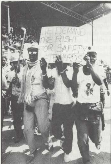
NUM members at a union memorial for miners killed at Kinross.