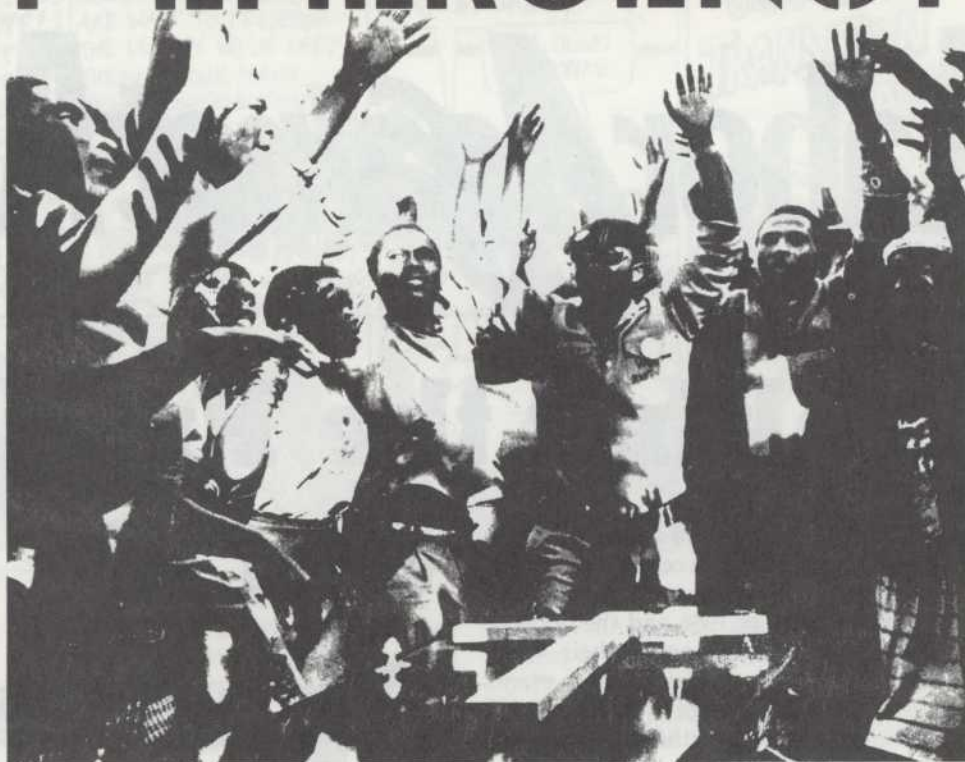
Funeral of a Crossroads squatter.

The State of Emergency demonstrates unequivocally that the Botha government has no intention of dismantling apartheid in any significant aspect. Its strategy is a war of attrition against the opposition, while buying time against international sanctions.